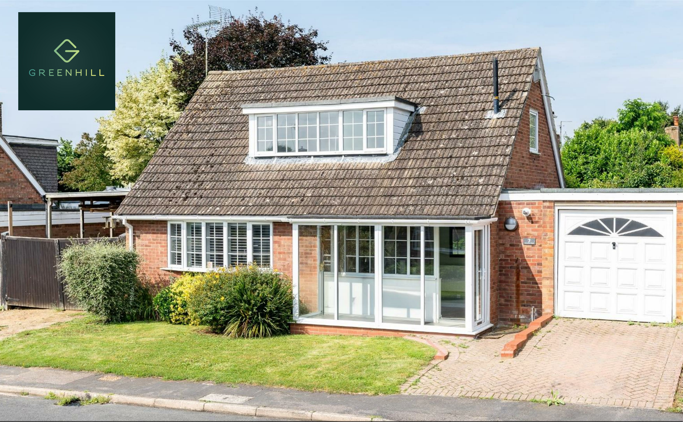
7 Townsend Close Barkway, Royston, SG8 8ER Guide price £588,000